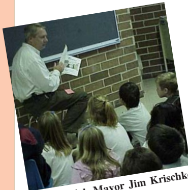
Lake Zurich Mayor Jim Krischke