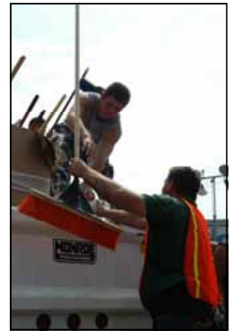
Can you H.E.L.P.