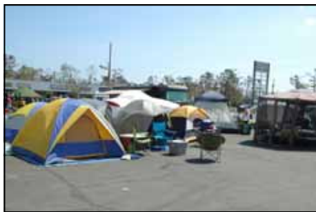
Would you need H.E.L.P.