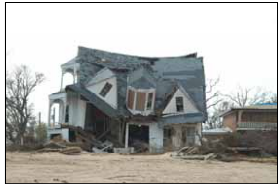
What if you lived here