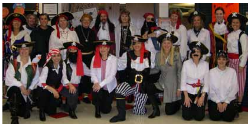
Left: The friendly pirates of Isaac Fox School. Do your homework or walk the plank!"