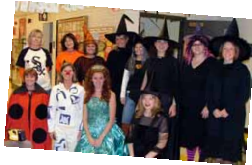
Left: May Whitney staff members lead by example when it comes to cool costumes.