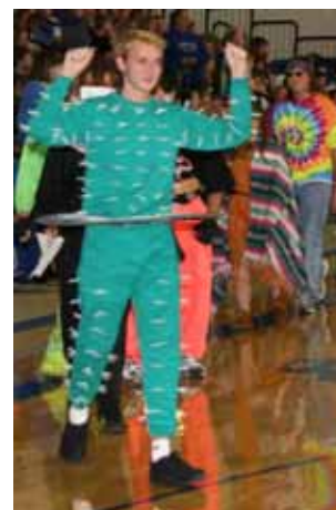
Uh, your guess is as good as mine.

THRIVE in 95 is produced by the Community Unit School District 95 Office of Communications & Community Relations for staff and interested community members. Story submissions are greatly encouraged.