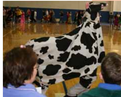
Who wants to milk this cow?