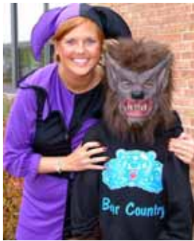
Left: the Jester and the Beast.