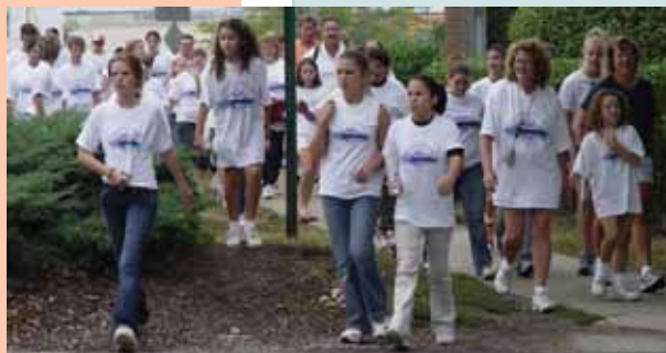
Above: Walkers take to the streets during the 2003 Walkathon.

For more information on how you can participate, visit the Ryan York Foundation web site: www.theryanyorkfoundation.org .